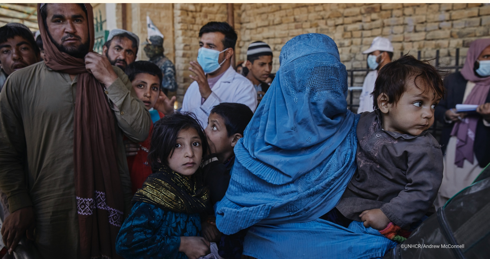
Afghan families returning from Pakistan at the Spin Boldak crossing