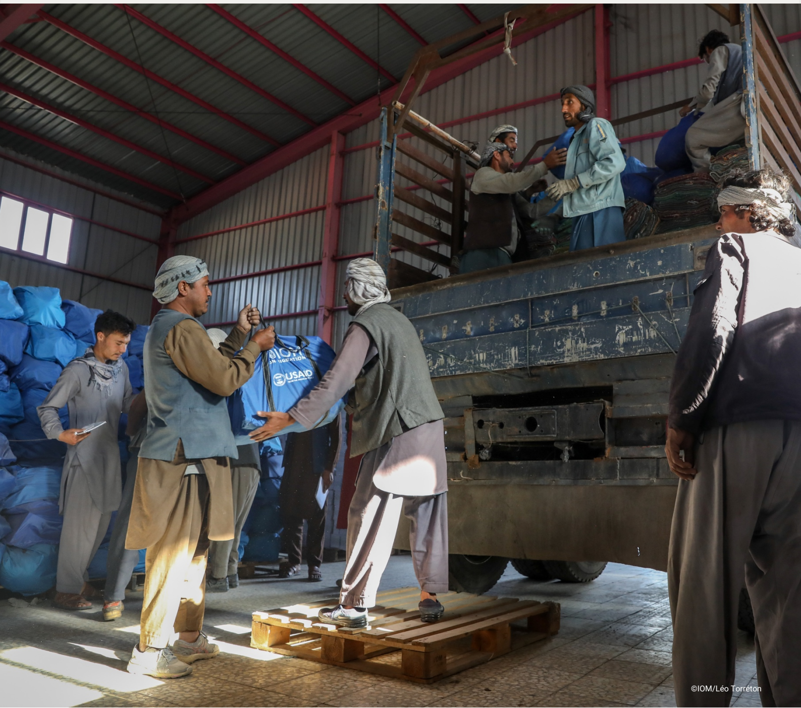
Loading up goods for distribution in Paktika Province

Faced with little choice, the United Nations arranged physical shipments of US dollar banknotes to Afghanistan to fund its humanitarian activities. Between December 2021 and March 2023, 68 shipments with a total value of US$2.4 billion were delivered to cover the salaries of aid workers, provide funding to NGO implementing partners, and finance other operational costs. The injection of cash into the system not only facilitated humanitarian activities, but also contributed to stabilizing the economy, helping ease the economic hardship of the Afghan people.