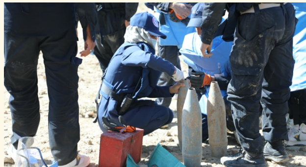
Explosive Ordnance Disposal Level 3 training

Following the June 2022 earthquake in Khost and Paktika Provinces, mine action partners deployed ambulances, quick response teams, and machinery to support aid delivery; they also shared education materials and maps of explosive-ordnance-affected areas with the humanitarian aid community.