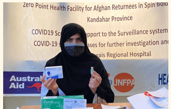
Zero Point clinic for returnees in Kandahar Province

led to one of the highest maternal death rates in the region. Now, combined with increasingly alarming levels of hunger and malnutrition and a reported rise in protection issues, the situation risks deteriorating further.