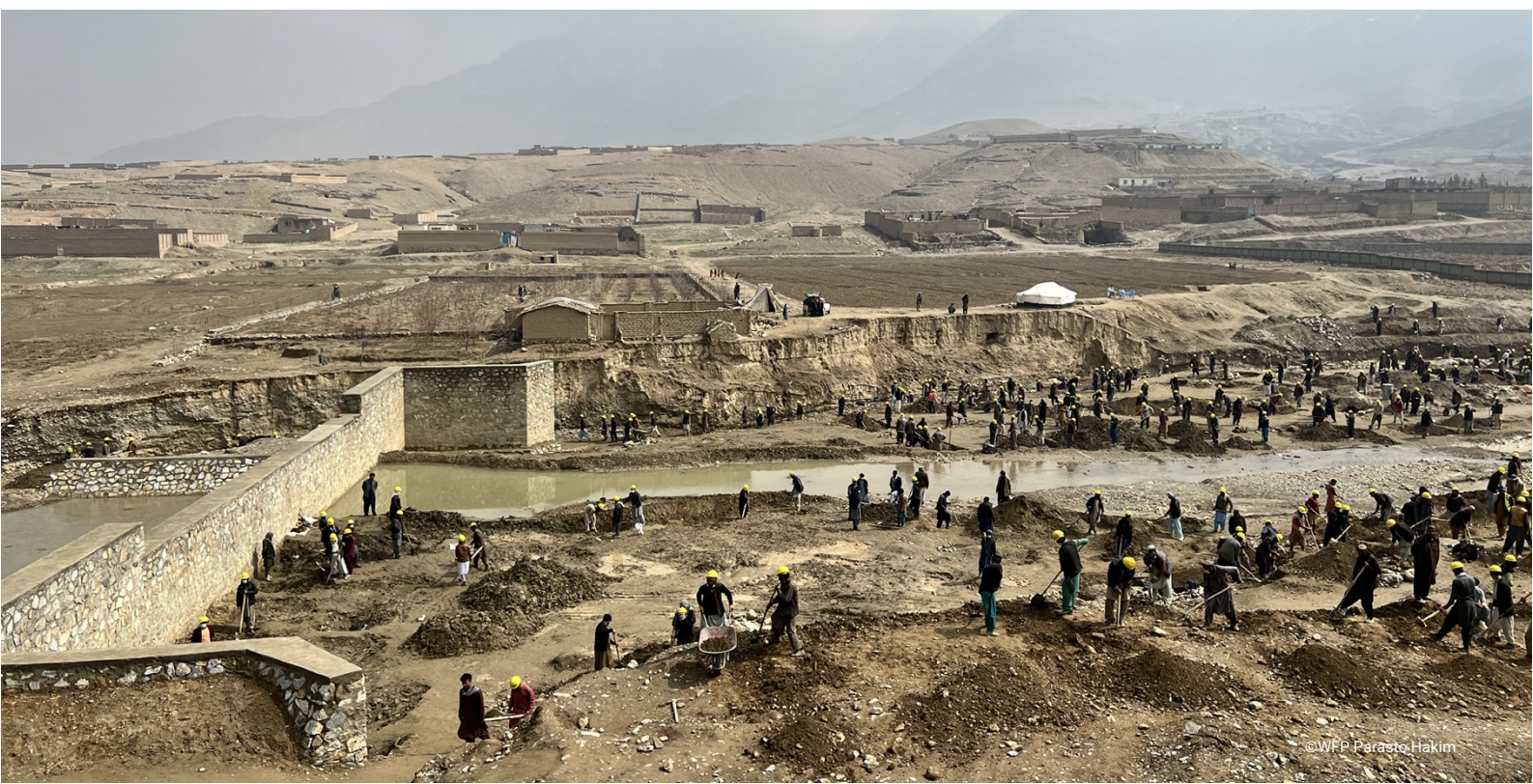
Workers near the water dam in Bagrami District, Kabul Province

The United Nations Country Team established a Gender Theme Group to provide a platform for discussing all gender-related issues across the United Nations in Afghanistan. The Gender Theme Group developed a workplan of priority actions and led activities to mark the annual 16 Days of Activism Against Gender-Based Violence international campaign, which started on 25 November 2022.