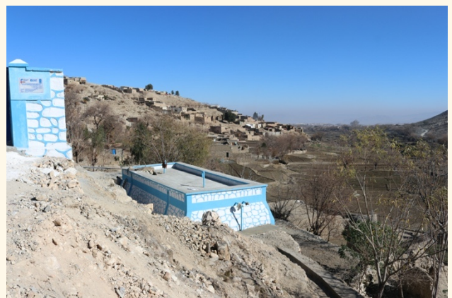
Asad Khil water reservoir