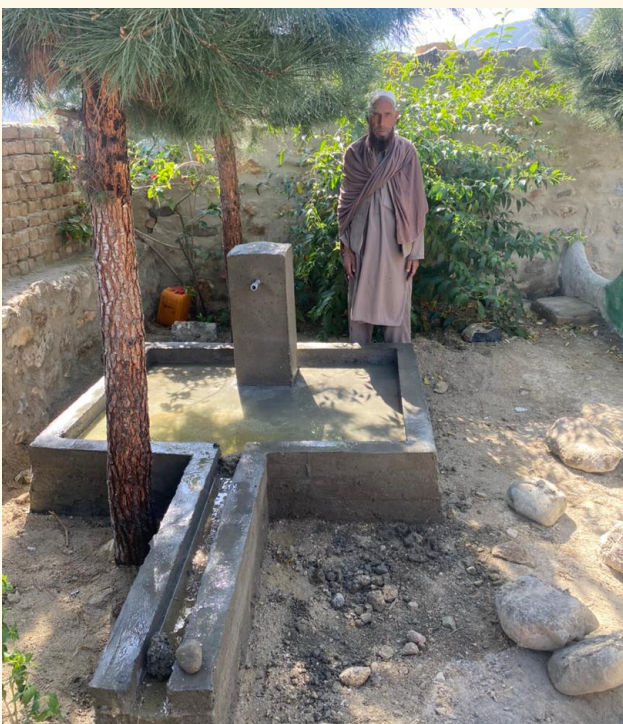
Asad Khil water tap