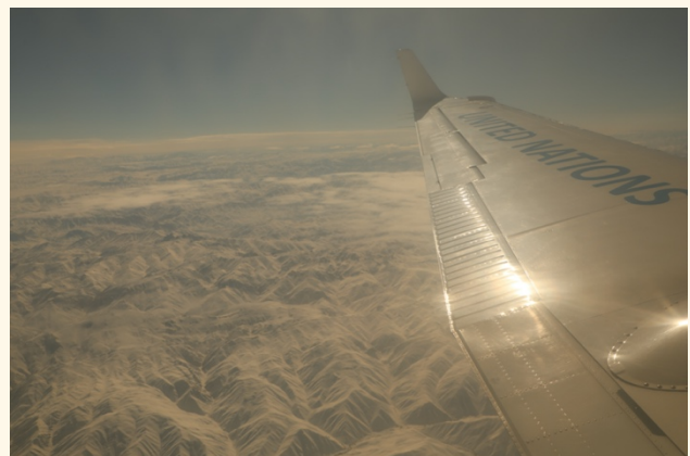
A UNHAS flight reaching remote parts of Afghanistan

"It is heartbreaking to hear from women who talk about reverting to irreversible coping mechanisms because they have no other means of survival," she says.