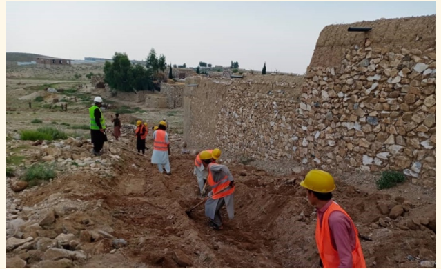
Workers on the Asad Khil pipe network project

In addition to being vital for health, access to safe drinking water also supports community cohesion and better attendance at school and work because of fewer sick days.