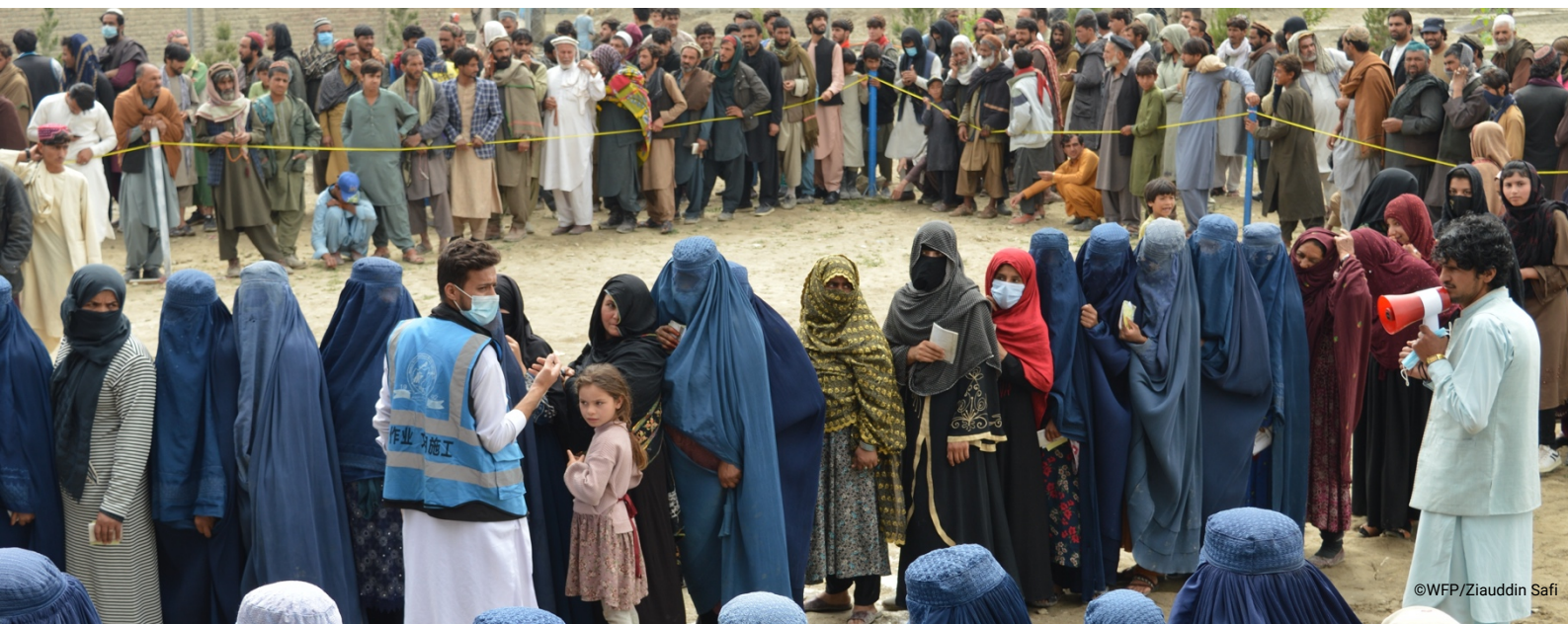
People wait to receive emergency food assistance in Kabul

While the challenges remain immense, the people of Afghanistan deserve and require our undivided attention. As humanitarian needs continue to grow, funding of the Humanitarian Response Plan is essential and must be increased. At the same time, funding for basic human needs and community resilience is just as important to support the people and help bring Afghanistan back onto a positive pathway toward sustainable development.