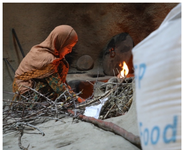
A widow and mother-of-five whose family depend on a cow and food aid for survival lights a fire in her home in a remote village in Badakhshan Province

The Afghanistan Humanitarian Fund (AHF) and the Special Trust Fund for Afghanistan (STFA) were streamlined to form the two wheels of the One UN funding framework. While the former facilitated swift and strategic humanitarian action in Afghanistan, the latter supported programmes for socioeconomic recovery. This arrangement was devised to provide clarity on the complementarity of the funding channels, along with those provided by international financial institutions (IFIs), namely: the World-Bank-administered Afghanistan Reconstruction Trust Fund (ARTF) which focused on health and education; the Afghanistan Infrastructure Trust Fund (AIF) administered by the Asian Development Bank which focused on agriculture; and the Afghanistan Humanitarian Trust Fund (AHTF) administered by the Islamic Development Bank with its focus on South–South cooperation.