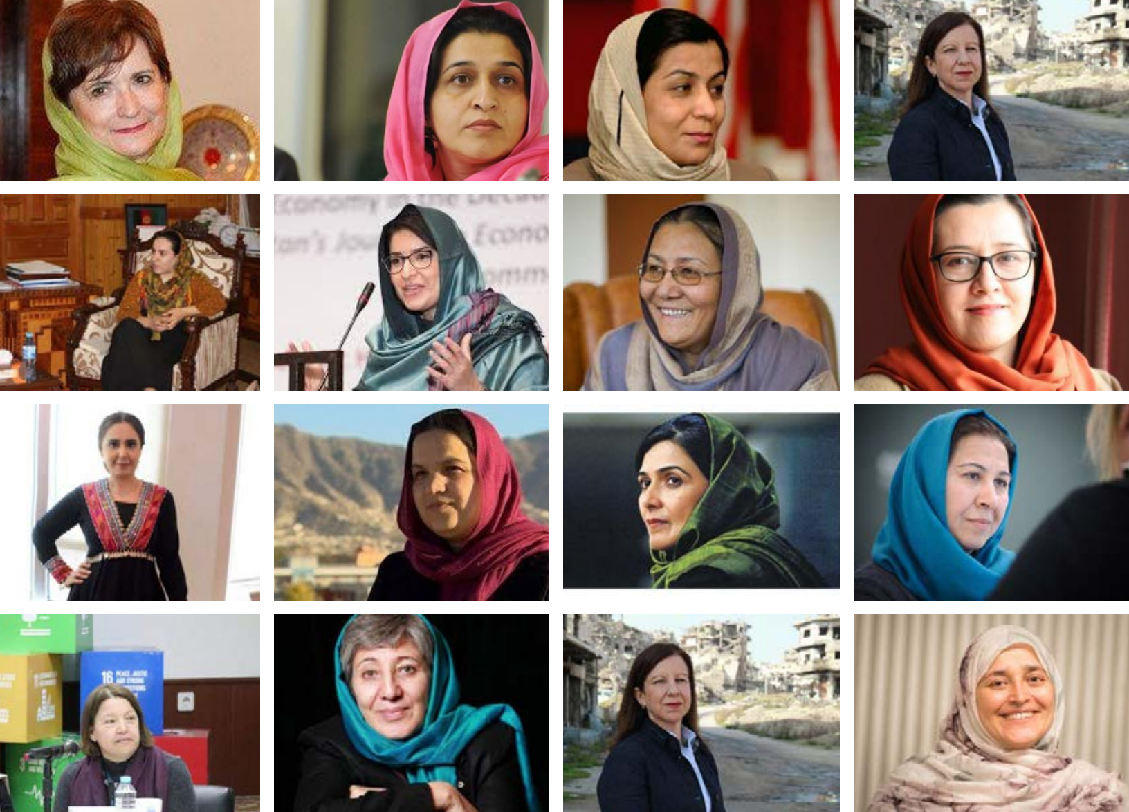
Some of the Crisis and Opportunity panelists